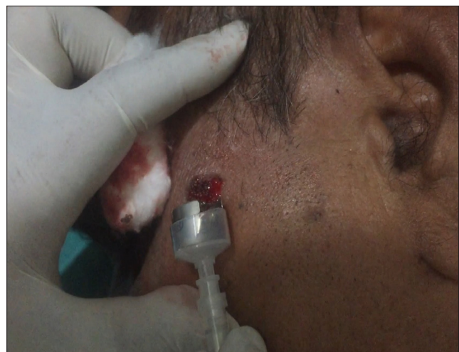
Multimedia_1: Video 1: A seborrheic keratosis is shaved with a customised blade with a syringe barrel holder