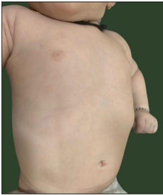
Figure 2a: Diffuse pigment dilution showing light skin over chest and abdomen.