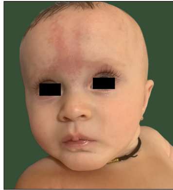
Figure 2b: Generalised pigment dilution of face making glabella naevus simplex more pronounced.