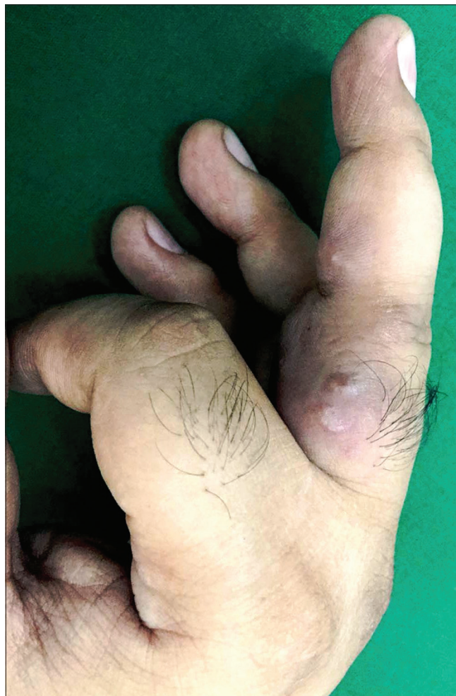
Figure 2: Close-up view showing erythematous to plum-colored indurated plaque with overlying two small vesicles on the proximal and middle phalanges of the third digit of the right hand

Some cases of eosinophilia associated with tumor necrosis factor- \alpha inhibitors have been reported before. 3 Wells syndrome-like lesions have been described at the injection site of etanercept 4 and adalimumab 5 as local reaction to the drug, but not away from the injection site as observed