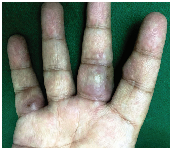
Figure 1: Erythematous to plum-colored indurated plaques on the volar aspect of the third and fifth digits of the right hand

Wells syndrome presents with sudden onset, single or multiple, erythematous, indurated or urticarial plaques which resolve without scarring over 2–8 weeks. Clinical variants of Wells syndrome include plaque type, annular