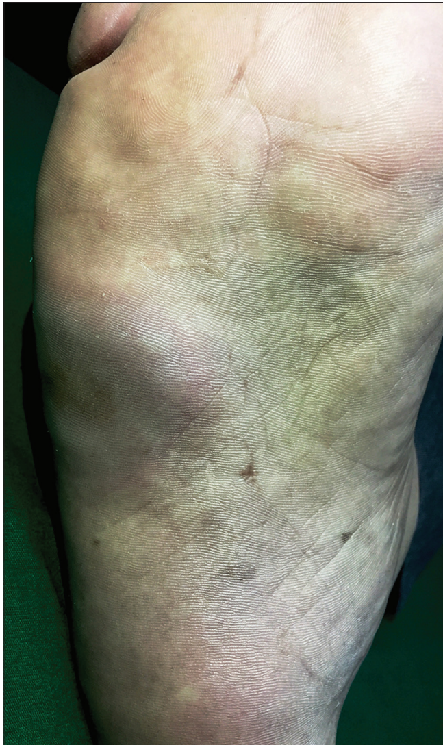
Figure 3: Erythematous to plum-colored indurated plaque on the sole of the right foot