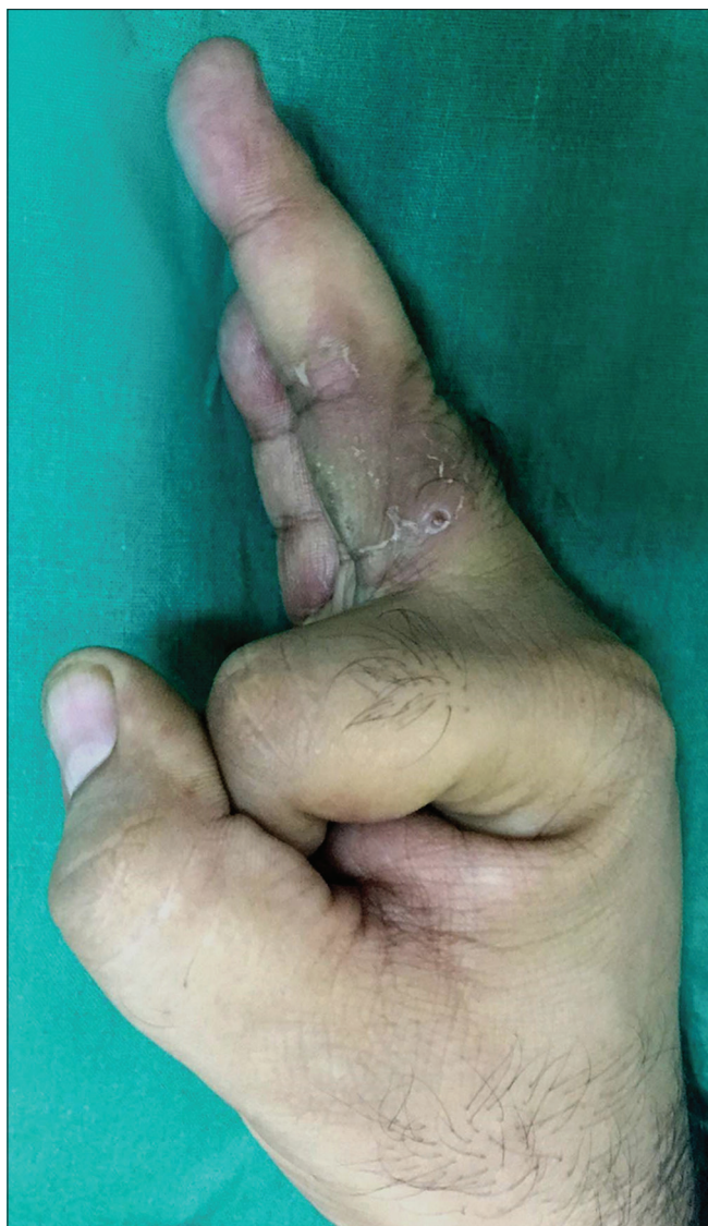
Figure 6: Improvement in edema with desquamation over the lesions 6 weeks after starting prednisolone

Garima Dabas, Dipankar De, Sanjeev Handa, Debajyoti Chatterjee 1 , Bishan Das Radotra 1