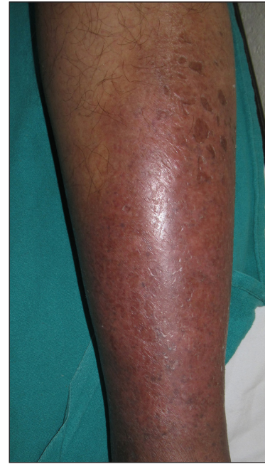
Figure 7: Circumferential erythematous indurated plaque over left lower limb suggestive of acute lipodermatosclerosis.

LDS can be subdivided into acute (<1 month), subacute (1–12 months) and chronic (>12 months) types. Acute, painful, erythematous, tender, indurated plaques on one or both legs, associated with the binding down of skin [Figure 7], should prompt the dermatologist to look into the possibility of acute LDS. 34 Histopathology reveals sparse septal lymphocytic infiltrates, ischemic necrosis at the centre of fat lobules, lipomembranous changes and septal sclerosis. 34,35 Imaging such as venous Doppler and duplex are done to check