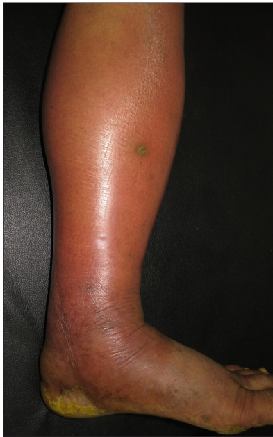
Figure 8: Ill-defined tender erythematous swelling involving lower 2/3 rd of the leg suggestive of cellulitis.