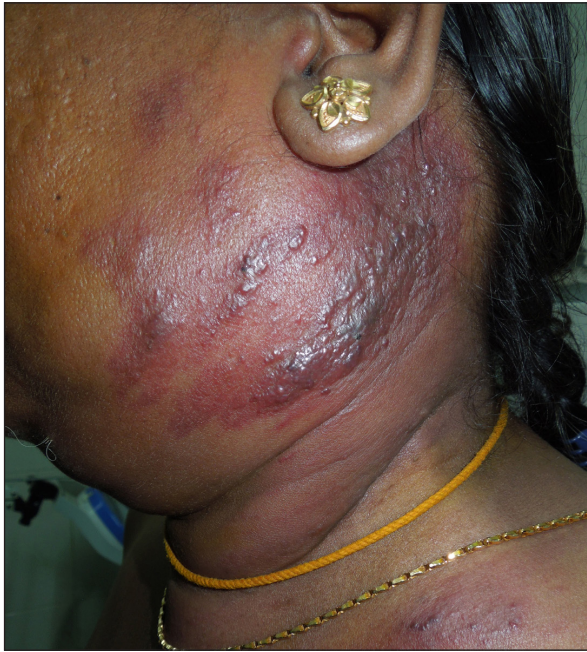
Figure 6: Multiple papulonodular lesions over an infiltrated erythematous plaque over the left cheek and neck region suggestive of carcinoma erysipeloides.