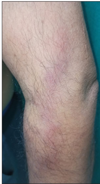
Figure 9: Linear erythematous streak over the medial aspect of leg and thigh suggestive of lymphangitis.