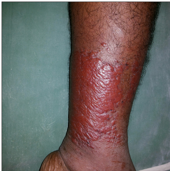
Figure 1: Well-demarcated tender erythematous oedematous plaque suggestive of erysipelas.

and face. A generalised variant is associated with fever, joint pain and myalgia. Endocarditis, encephalitis, meningitis, peritonitis and sepsis are the complications. 4 Histopathology reveals papillary dermal oedema, dilated vessels and mixed inflammatory infiltrate composed of neutrophils, lymphocytes and eosinophils. Treatment includes antibiotics. 5