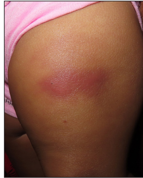
Figure 3: Target-like erythematous indurated plaque over left thigh following diphtheria pertussis tetanus injection.

It is seen within 1–4 days of vaccination and characterised by an oedematous, erythematous rash over the extremities. Histopathology reveals marked papillary oedema with no inflammation in the oedematous area and perivascular mild