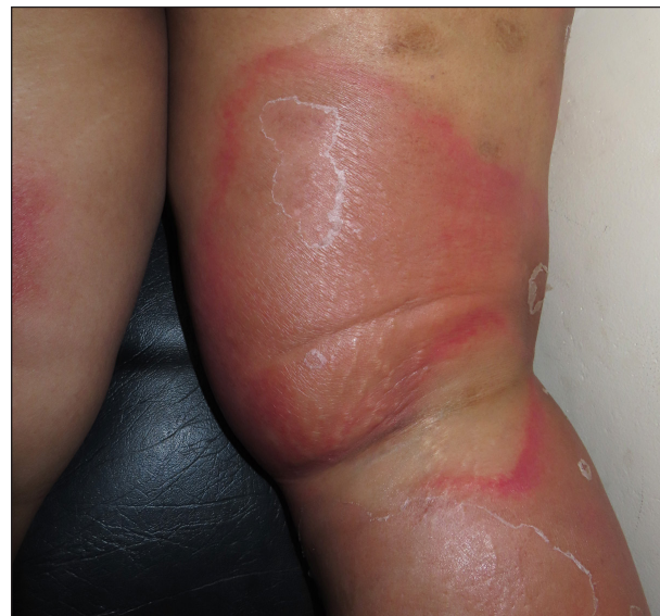
Figure 4: Well-defined erythematous patch with central clearing and a collarette of scales at the periphery suggestive of erythema chronicum migrans.

Lyme disease is transmitted through Ixodes tick bite by the species Borrelia burgdorferi . It has three stages: early localised, disseminated and chronic disease. The early localised type is also known as erythema chronicum migrans [Figure 4] and occurs at the site of a tick bite. It is characterised by centrifugally spreading macule erythematous oedematous