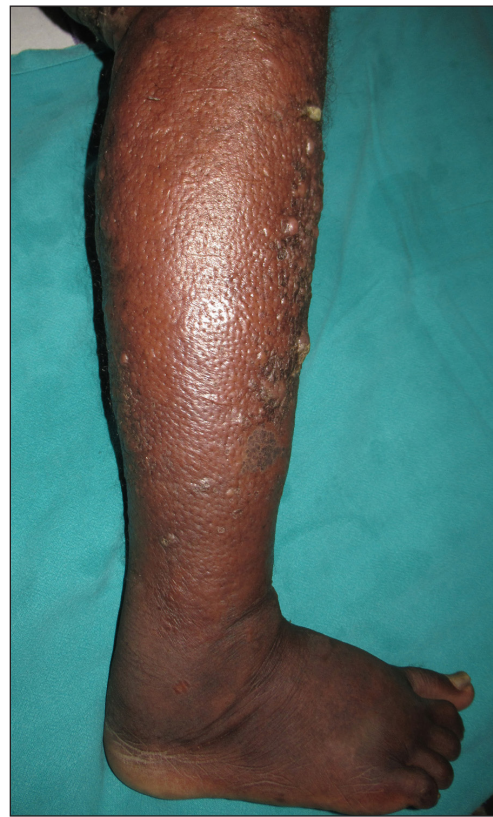
Figure 11: Erythematous oedematous plaque with peau d'orange surface and hyperkeratotic warty papules over right leg suggestive of lymphedema.

Lymphedema clinically presents as erythema, non-pitting unilateral oedema starting over the toes and progressing proximally and later shows hyperkeratotic warty dyspigmentation [Figure 11]. Patients with lymphedema are prone to superficial and deep cutaneous infections due to loss of natural skin barrier and impaired lymphatic drainage. 58 Differentiation of uncomplicated lymphedema from