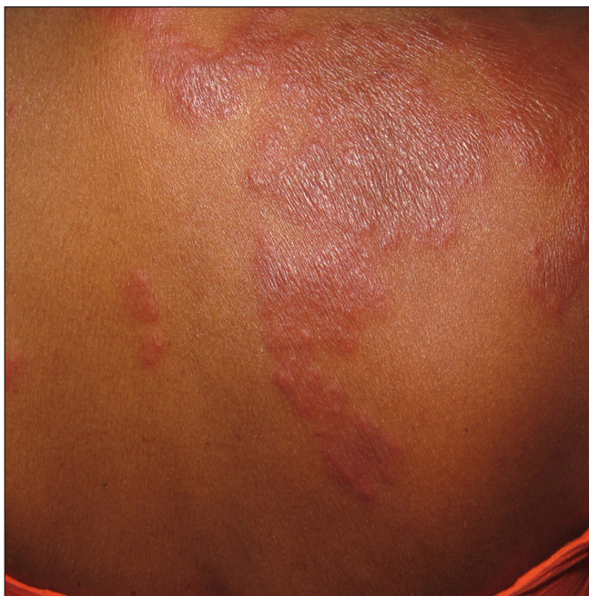
Figure 5: Multiple discrete to coalescing oedematous to pseudo vesicular erythematous tender plaques over the upper back suggestive of sweet syndrome.

It is characterised by erythematous infiltrated papules and plaques that give a pseudovesicular look [Figure 5] over the face, upper trunk and upper limbs. It is differentiated from erysipelas by presence of coalescing papules which form giant irregularly shaped plaque with relapsing, chronic course and is unresponsive to antibiotics. Histopathology reveals papillary dermal oedema with dense mature neutrophils. Oral prednisone is considered as the treatment of choice.