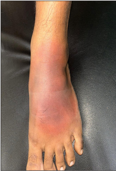
Figure 2: Well-circumscribed dusky erythematous plaque on the left dorsa of foot.

a pseudocapsule appearance. The organism is highlighted by the periodic acid Schiff and Gomori methenamine silver stain. 9 It usually responds to itraconazole, fluconazole and amphotericin B. 10