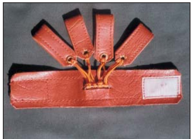
Figure 3: Finger loop splint for prevention and correction of hand deformities