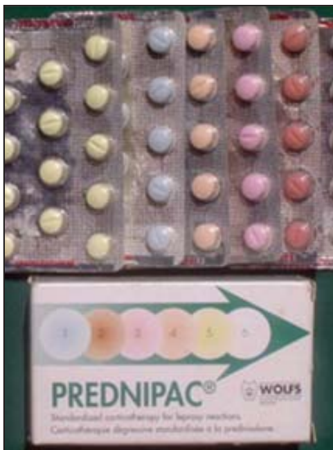
Figure 2: Standard steroid regimen of prednisolone

We retrospectively analyzed the records of 426 leprosy patients with reactions treated using a standard steroid regimen 11 under field conditions. This regimen