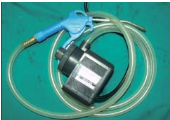
Figure 1: Tulu submersible pump

Hence, any device that could minimize patient handling would be useful. Last year, my wife Chitra bought a small fountain to be placed on the table in our home. It has a tiny submersible pump which re-circulates water pumping it through a dolphin's mouth. Derma India ® procured for me a small submersible pump [Figure 1] (Tulu submersible pump model THS 3000 240-250 Power 35 Watt) with which we could siphon water from a container and pump it through an adjustable hand piece. It is possible to place potassium permanganate, hydrogen peroxide or saline in the container and direct the stream of fluid with some force over the body of the patient to dislodge crusts and clean