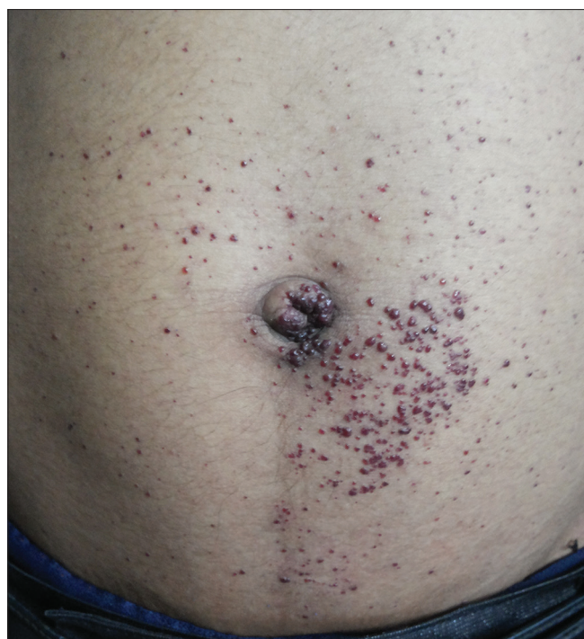
Figure 1: Multiple, red to purple, hyperkeratotic papules on anterior trunk with grouping around umbilicus

A 20-year-old boy presented with multiple, discrete, 2-4 mm sized, red-purple papules on the arms, trunk, penis, scrotum and legs, becoming confluent around the umbilicus [Figure 1]. The papules started appearing 3 years ago on his thighs and occasionally bled on trauma, without any other symptoms. The patient had episodic burning pain in both hands and feet, heat intolerance and decreased sweating. There was no history of abdominal pain, bone pain, edema of the feet, auditory or neurological complaints