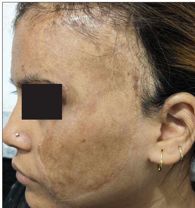
Figure 1d: Ten months after a single session of non-cultured epidermal cell suspension and four sessions of CO 2 laser. Further homogenisation of colour, flattening, merging of margins and improvement in texture, but there was hyperpigmentation on the skin of the graft. The patient was moderately satisfied with the resultant appearance.

us. The patient rated the overall improvement in appearance as 7 out of 10 on a visual analogue scale.