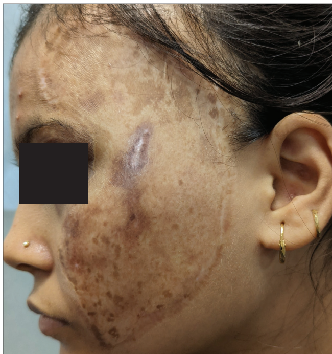
Figure 1c: One month after the non-cultured epidermal cell suspension session. There was significant improvement in the colour match and skin texture. The elevation was reduced and the follicular openings became less prominent. The linear scarred area over the zygomatic ridge healed slowly compared to the surrounding skin.

of modified Kligman's regimen for 3 months prior to taking up for surgery.