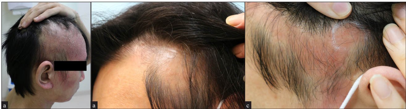
Figure 1: Three men with severe atopic dermatitis (a) 28-year old, (b) 47-year old and (c) 25-year old, presented with erythematous, diffuse, non-scarring alopecic patches on the frontal and parietal scalp following the use of dupilumab.

Multiple case reports and clinical studies suggest that dupilumab may act as a novel remedy for AA. It has been proposed that dupilumab could treat Th2-associated inflammation in the hair follicles and promote hair growth. 1 Nonetheless, there are multiple reports of patients developing alopecic patches while on dupilumab. 2–7 These differences in