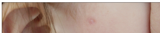
Figure 2b: Two months after a single copper vapor laser treatment. Copper vapor laser settings are average power – 0.9 W and exposure time – 0.3 s