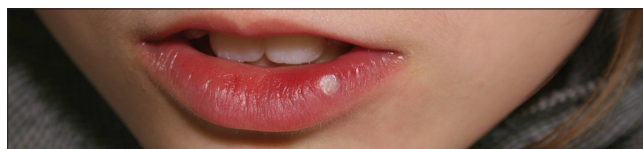
Figure 1b: Blanching and shrinking of the pyogenic granuloma immediately after the copper vapor laser treatment. Copper vapor laser settings are average power – 0.8 W and exposure time – 0.2 s