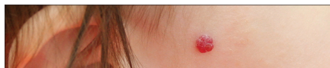
Figure 2a: Pyogenic granuloma on the right cheek in a 1.5-year girl, before laser treatment