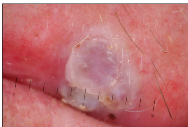
Figure 4b: After copper vapor laser treatment, the focus has changed dramatically and acquired a white-gray tint due to coagulated vessels and cavities

removal was complete in a single session. None of the patients showed any recurrence after being followed up for 24 months after the laser treatment.