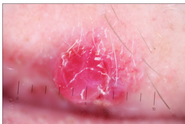
Figure 4a: Dermoscopy of pyogenic granuloma: the focus is symmetrical, the boundaries are clear cut and the structure is homogeneous, lacunar, well-defined, rounded or oval red structures present