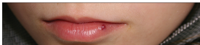
Figure 1a: Pyogenic granuloma over the vermilion border in a girl, nine years old, before laser treatment