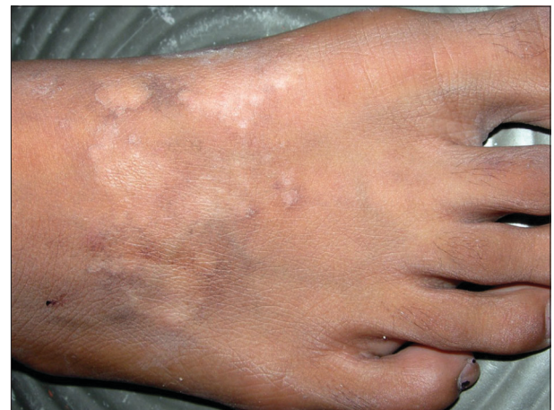
Figure 3: Dry scaly lesions over the dorsum of the foot due to allergic contact dermatitis from footwear