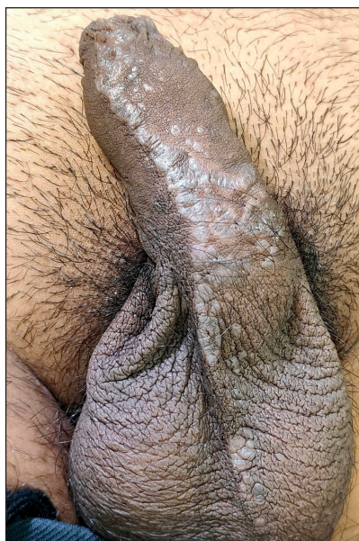
Figure 1a: Well-defined skin-coloured to violaceous flat-topped papules linearly arranged over the ventral aspect of the penis, extending over the scrotum.

[Figure 1b], which corresponded to hypergranulosis in the histopathological examination of skin biopsy. While annular lichen planus is frequently observed in the penile region of men, the erosive variant predominantly affects the vulva in women. The linear lichen planus on the genitalia represents a rare clinical presentation.