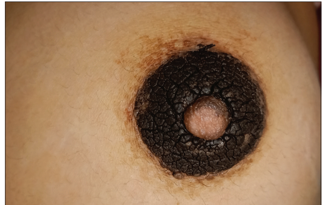
Figure 1: Hyperpigmented verrucous plaque on areola and nipple

Hyperkeratosis of the nipple and areola is a rare skin disease. The typical pathological features are persistent verrucous thickening and dark brown pigmentation of the nipples and areolas, without induration or oozing. The aetiology of naevoid hyperkeratosis of the nipple and areola is unclear. According to the research by Obayashi et al. , 80% of cases are women aged 20–40 years. It occurs bilaterally and affects