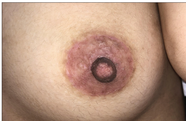
Figure 3: Follow-up at six months shows a natural appearance without obvious scars or disease recurrence

of the disease. 5 Levy-Frankel classification has been widely used for hyperkeratosis of the nipple and areola. Type 1 hyperkeratosis is an extension of an epidermal nevus. Type 2 hyperkeratosis is associated with other dermatoses, such as acanthosis nigricans, ichthyosis, lymphoma or Darier disease and Type 3 is idiopathic or naevoid hyperkeratosis. This case was classified as Type 3. 1