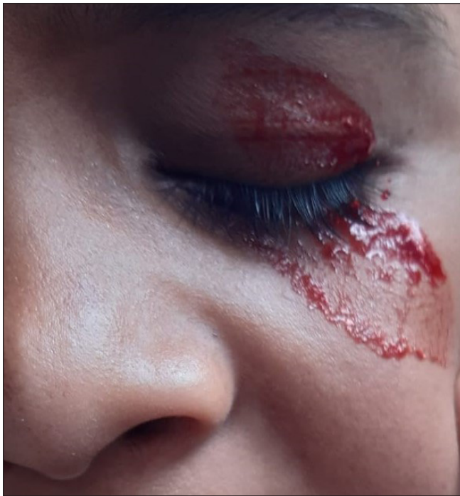
Figure 1: Sweat admixed with blood on the eyelids.

A ten-year-old boy presented at the dermatology outpatient department with a distressing complaint of recurrent bleeding from his cheeks, eyelids [Figure 1] and ears [Figure 2] since the past two months. Remarkably, there were no reports of bleeding from any other sites. The child had recently undergone septoplasty following which there was a prolonged period of absence from school and a marked change in his demeanour. He exhibited heightened irritability, frequent temper tantrums and voluntary social isolation. Over the subsequent weeks, he experienced recurrent episodes of bleeding from the intact skin around his eyes (non-conjunctival) and ears, including the skin around the ear canal and cheek. These episodes increased in frequency to become a daily occurrence, characterised by spontaneous, painless bleeding lasting from mere seconds to