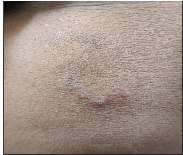
Figure 1: A well-defined serpiginous tract noted over the left flank.

A middle-aged woman presented with itchy, red, raised lesions on her waist for 10 days. Examination revealed a well-defined serpiginous erythematous tract on the left flank [Figure 1]. Polarised dermoscopy (Dermlite DL5, 10x magnification) showed fine white scaling arranged in a serpiginous fashion with brownish-black dots and clods along the length [Figure 2a]. These brownish-black dots indicate spongiotic dermatitis, accompanied by an inflammatory infiltrate, vasodilation, red blood cell extravasation, and hemosiderin deposition. The parallelly arranged brown clods correspond to the helminth's body. Ultraviolet fluorescence dermoscopy revealed bluish fluorescence along the tracts, and enhanced visibility of hidden larval tracts [Figure 2b]. This technique aids in identifying the advancing larvae, guiding targeted biopsies, and facilitating appropriate treatment.