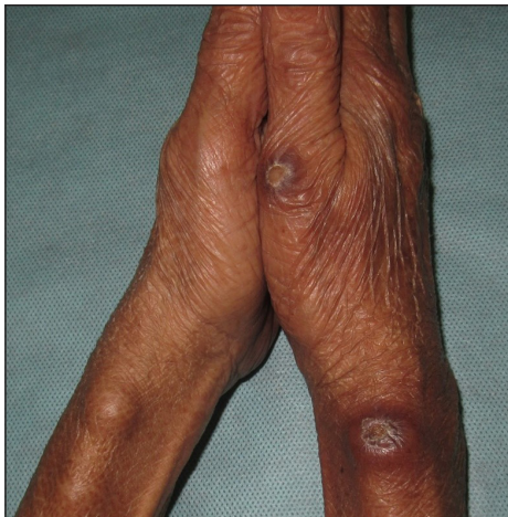
Figure 1: Well-circumscribed nodular swellings on the distal radial border over the bilateral wrist area and over the right proximal thumb.

and a glove-and-stocking pattern hypo-aesthesia were noted. The differential diagnoses of ganglion cyst, giant cell tumour of the tendon sheath (GCTTS), and epidermoid cyst were considered, and a fine needle aspiration cytology (FNAC) was done. FNAC revealed foamy macrophages containing clumps of acid-fast-bacilli (AFB) on Ziehl Neelsen (ZN) staining [Figure 2]. High-resolution ultrasonography (HRUS) of nerves showed nodular thickening of the right radial cutaneous nerve proximal to the wrist joint over a length of approximately 6 cm. The maximum diameter of the nerve was 15 mm. The nerve fascicles were swollen and appeared heterogeneously hypoechoic, surrounded by the echogenic perineurium and epineurium. Focal outpouchings were also noted arising from the nerve [Figure 3]. Colour Doppler evaluation showed mildly increased vascularity suggestive of subclinical neuritis. Similar features were noted in the nodular thickening of the left radial cutaneous nerve. The nerve conduction study was consistent with peripheral demyelinating sensorimotor neuropathy. Slit skin smear from bilateral ear lobes was positive with a bacteriological index