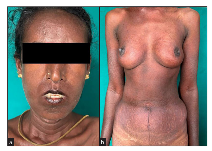
Figure 1: Woman with systemic sclerosis with diffuse maculopapular rash following intake of herbal medicine (Smilax china) (a) over the face with chapped lips and (b) over the trunk.

IU/L (Normal: 0–35 IU/L). A diagnosis of probable DRESS (Drug Reaction with Eosinophilia and Systemic Symptoms) was made due to the presence of eosinophilia and hepatitis, with a Regiscar score of 4. The patient was admitted and started on oral prednisolone (0.5 mg/kg) and IV ceftriaxone 1 g once daily for heavy Escherichia.coli growth in vaginal swabs taken from erosions over the vaginal mucosa. After two days, the lesions progressed to vesiculobullous eruptions with epidermal detachment all over the body. On examination, multiple vesicles and bulla were present all over the body, with sheets of necrosis and spots seen over the trunk and extremities [Figures 2a and 2b]. The biopsy from the posterior trunk showed subepidermal blister formation containing lymphocytes, macrophages and occasional acantholytic cells along with RBCs and eosinophilic fluid.