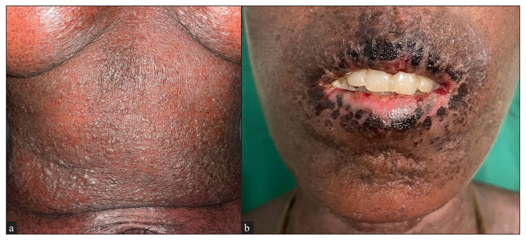
Figure 2: (a) Confluent vesicles and bullae over the trunk with sheets of necrosis on a background of erythema and (b) oral erosions with haemorrhagic and dried up crust over the lips and perioral area suggestive of toxic epidermal necrolysis.