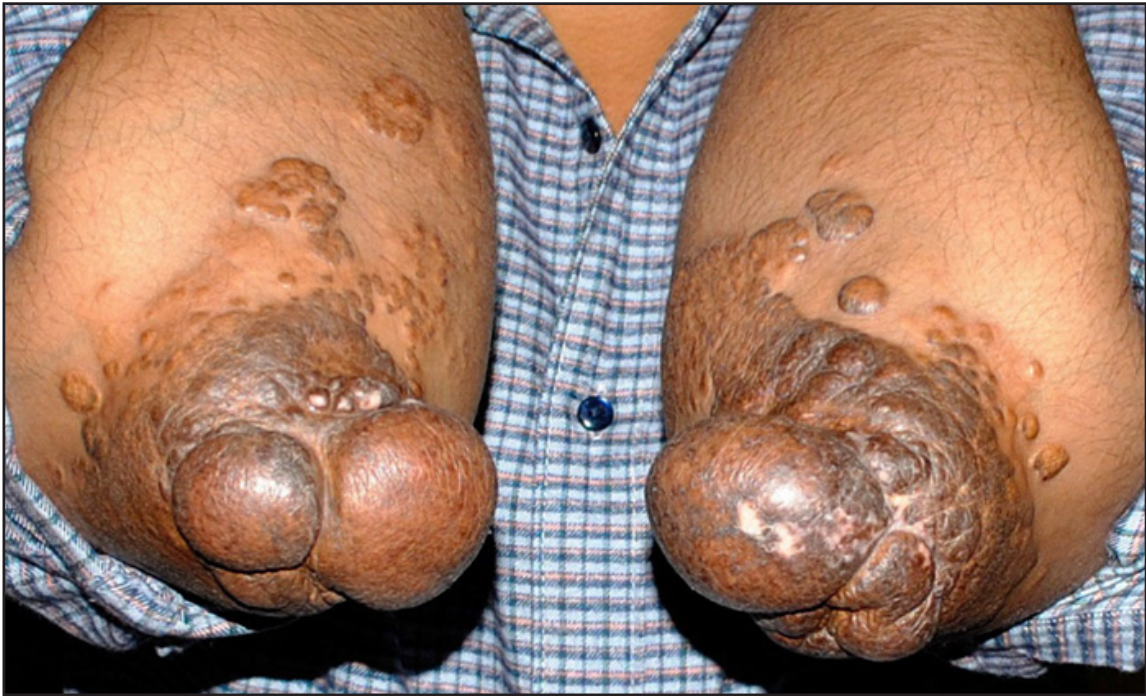
Figure 1b: Tendon xanthomas over the elbows.