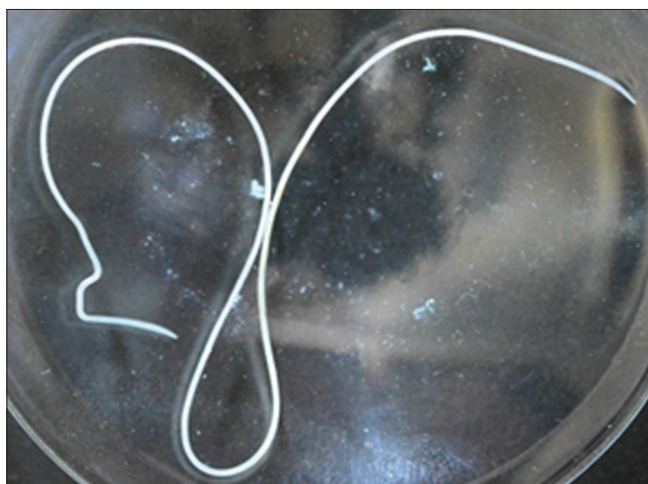
Figure 3: Thin, cylindrical, white worm at about 20 mm in length highly suggestive of Dirofilaria repens

surgery, the patient did not present any clinical evidence of recurrence within a follow-up period of three years.