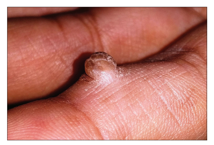
Figure 11: Acral fibrokeratoma