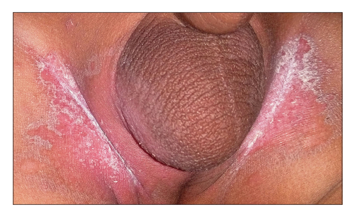
Figure 4: Candidal intertrigo. Note the characteristic scalloped border with collarette of scales

Bacillary angiomatosis is primarily a vasoproliferative disease, seen in human immunodeficiency virus infected