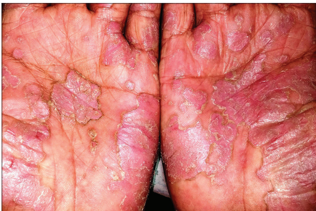
Figure 9: Palmar pustulosis