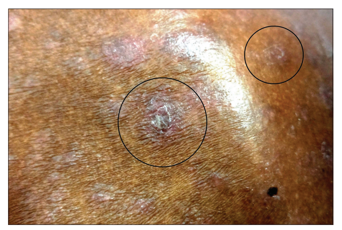
Figure 6a: Collarette scales on top of erythematous papules in secondary syphilis (black circles)