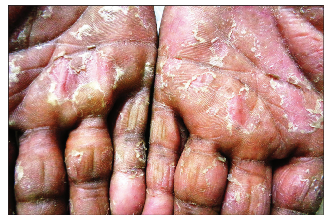
Figure 2: Keratolysis exfoliativa