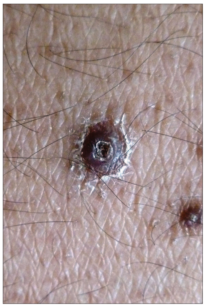
Figure 14: Kyrle's disease

Adya, et al. Dermatoses with "collarette of skin"