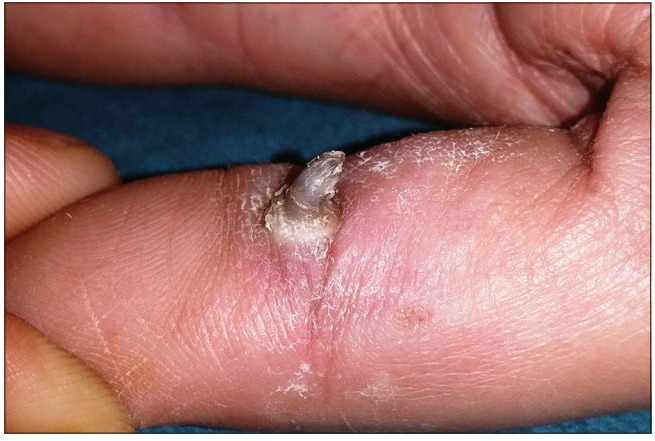
Figure 13: Cutaneous horn