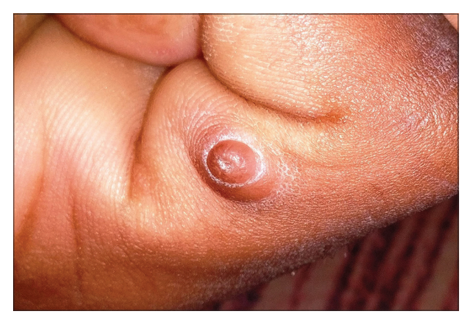
Figure 12: Rudimentary supernumerary digit