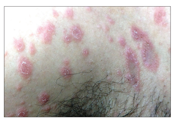
Figure 1: Pityriasis rosea

Candidiasis refers to an infection caused commonly by the yeast Candida albicans . Cutaneous candidiasis can manifest as congenital and neonatal candidiasis, diaper dermatitis