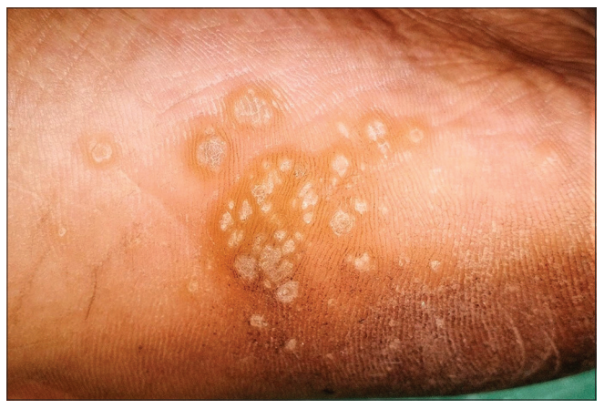
Figure 7: Plantar warts with colarette of raised surrounding normal skin. Note the abrupt termination of dermatoglyphics at the inner margin of the collarette.