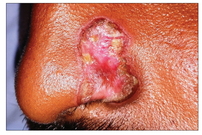
Figure 3: Porokeratosis

and candidal intertrigo. Clinically, the lesions appear as erythematous eroded patches with marginal and satellite pustules. The pustules rupture to form a fringed irregular scalloped edge with a collarette of scaling [Figure 4]. The anogenital region is commonly involved and lesions involving the crural folds invariably exhibit deep central clefting.<sup>15,16</sup>