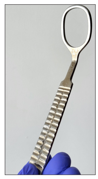
Figure 1: Stainless steel skin clamp with a grooved shaft handle, a tapering neck and an oblong fixing ring inclined at 135° at the distal end, which provides a wide view of the operating field. The inclination helps in better positioning and grip of the fixing ring onto the target surface.

Some of the possible uses include examination of the oral cavity, especially the buccal mucosa, examination and cryotherapy of lesions on the female genitalia, annular pressure to achieve haemostasis during skin suturing (especially on the scalp), and providing a taut surface for punch biopsies, punch grafting and dermabrasion in vitiligo surgery. [Figures 2 and 3, Video 1]. It can also provide a better haemostatic field during graft harvesting in hair transplantation and injecting platelet-rich plasma on the scalp. The specifications of the instrument, like the diameter of the ring and the shape, can