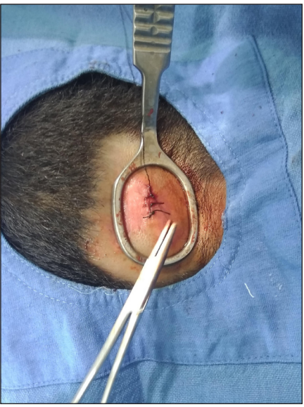
Figure 3: Annular haemostasis for skin suturing or other procedures especially on highly vascular areas like the scalp.

How to cite this article: Ashique TK, Jayasree P, Kaliyadan F. A multi-utility skin clamp for clinical examination and minor procedures in dermatology and other specialities. Indian J Dermatol Venereol Leprol. doi: 10.25259/IJDVL_1550_2024