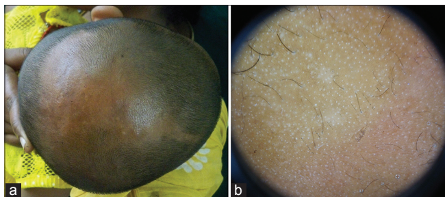
Figure 1: (a) Triangular patch of nonscarring alopecia over left temporo-parieto-vertex region of scalp; (b) Dermoscopy showing normal follicular openings and vellus hairs

A 1-year-old girl, born of a second degree consanguineous marriage presented with triangular alopecia on the scalp since birth. She was delivered at term by spontaneous vaginal delivery. No instruments or fetal scalp electrodes had been used during delivery. There was no history of trauma or raw areas present over the scalp at birth. There was no family history of similar disorders. The child was subjected to repeated tonsuring over 1 year, with a hope of hair regrowth in the area of alopecia. Examination revealed a well-demarcated, 13 × 12 × 10 cm triangular patch of non-scarring alopecia occupying the left temporo-parieto-vertex region of scalp [Figure 1a], which on dermoscopy revealed normal follicular openings and vellus hair [Figure 1b]. Hair pull test at the periphery of the patch was negative. No other abnormality of skin or nail was noted. Skin biopsy from the patch of alopecia revealed a few telogen vellus hair follicles, which were miniaturized. There was no perifollicular inflammation and scarring. [Figure 2a and b]. The parents were informed regarding the option of hair transplantation as the patch was large and scarring was a possible sequel of staged excision of the patch.