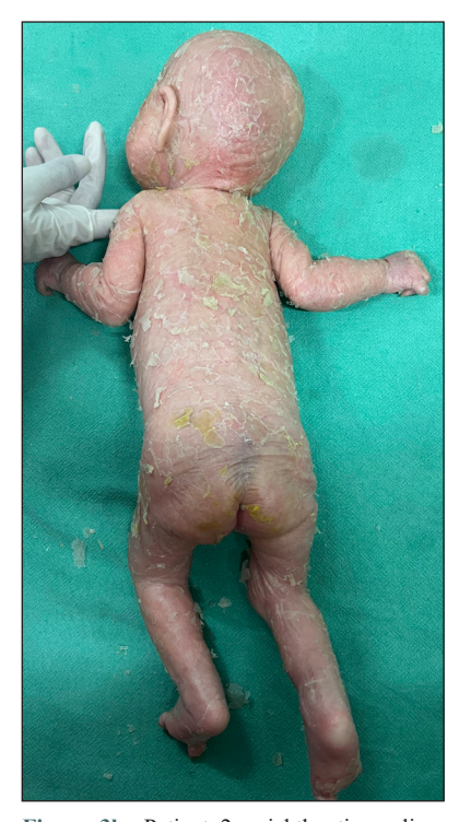
Figure 3b: Patient 2 – ichthyotic scaling, desquamation of skin over lower limbs.