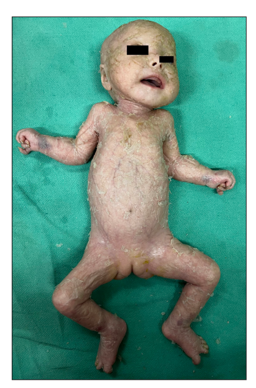
Figure 3a: Patient 2 – Generalised lamellar ichthyosis with fissuring of skin in folds, flexion contractures of upper and lower limbs, arthrogryposis and palmoplantar keratoderma.

The younger sibling of the above patient (patient 2), a three-month-old female, presented with similar cutaneous and systemic complaints since 1.5 months of age along with fever, cough, feeding difficulties and delayed developmental milestones. On general examination, pallor, microcephaly and severe stunting were evident. Cutaneous findings were similar to the elder child [Figures 3a and 3b]. Abdominal palpation revealed hepatomegaly 3 cm below and splenomegaly 2 cm below the respective costal margins. Musculoskeletal