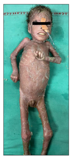
Figure 1a: Patient 1, Generalised ichthyosis with desquamation and fissuring and arthrogryposis.

Ophthalmological examination revealed ectropion and bilateral corneal opacities [Figure 1c]. Musculoskeletal examination revealed arthrogryposis, hypotonia and spasticity. The remaining systemic examination was normal. Hepatosplenomegaly was absent. The patient had reduced haemoglobin (4.8 g/dl) with normal liver/kidney function tests. Magnetic resonance imaging (MRI) of the brain showed