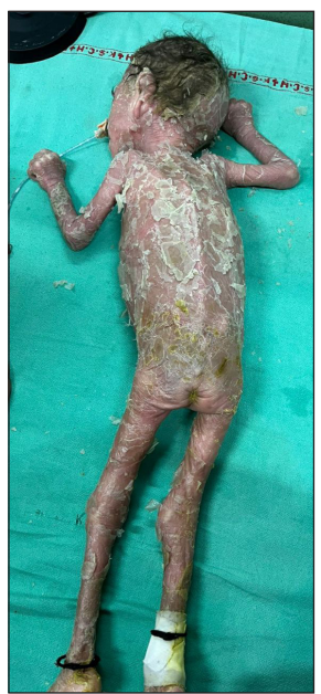
Figure 1b: Ichthyosiform, yellow-brown coarse scales with desquamation of skin over the back.