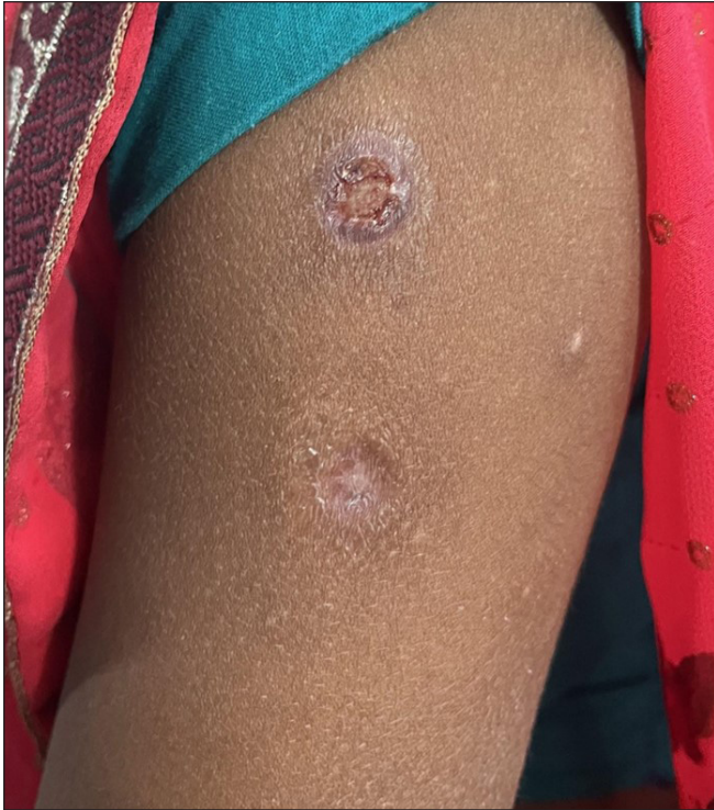
Figure 4: Superficial ulcer with surrounding erythema on left arm – 1 week after administration of MIP vaccine. Old healed scars can also be noted.

of the effective vaccines for the prevention of leprosy that could be used under national programmes, with or without chemoprophylaxis, for contact with leprosy patients and the general population. Evidence of adverse effects was found to be limited.