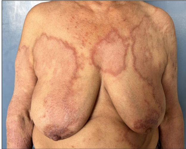
Figure 2a: Case of borderline lepromatous leprosy with multiple large infiltrated and erythematous plaques.