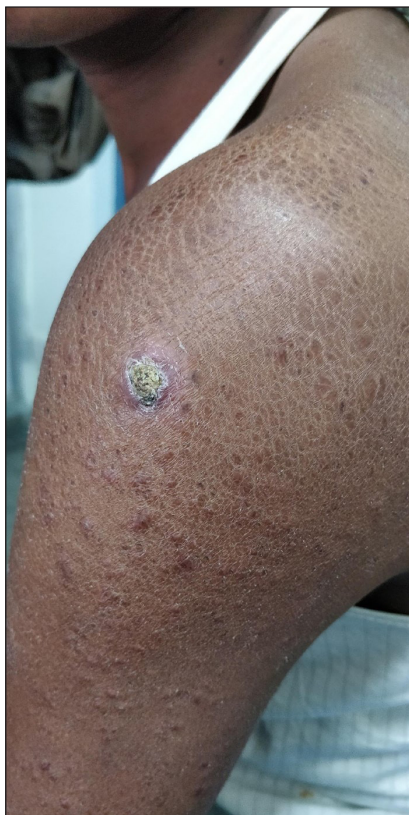
Figure 5a: Patient with granulomatous dermatitis after MIP vaccination showing crusted erythematous nodule at the site of injection surrounded by ichthyosiform changes and multiple reddish-brown papulonodules on the left upper limb.

Combining MIP vaccination as immunotherapy to newly detected cases and as immune prophylaxis to their contacts