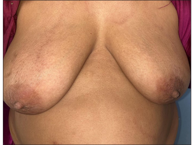
Figure 2b: Decrease in erythema and infiltration after receiving 6 months of multidrug therapy and two doses of MIP vaccine.

found MIP to be safe in leprosy, with an overall favourable effect on reactional episodes, particularly ENL.