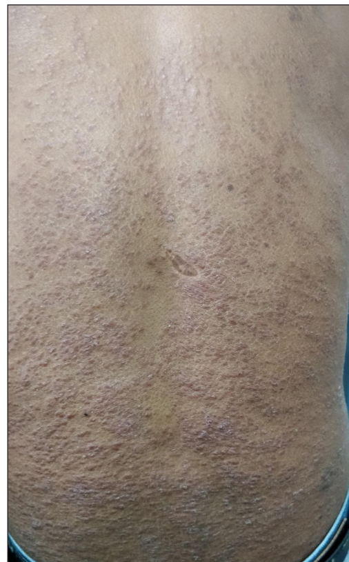
Figure 5b: Patient with granulomatous dermatitis after MIP vaccination showing multiple reddish brown papules with superficial scaling on the back.