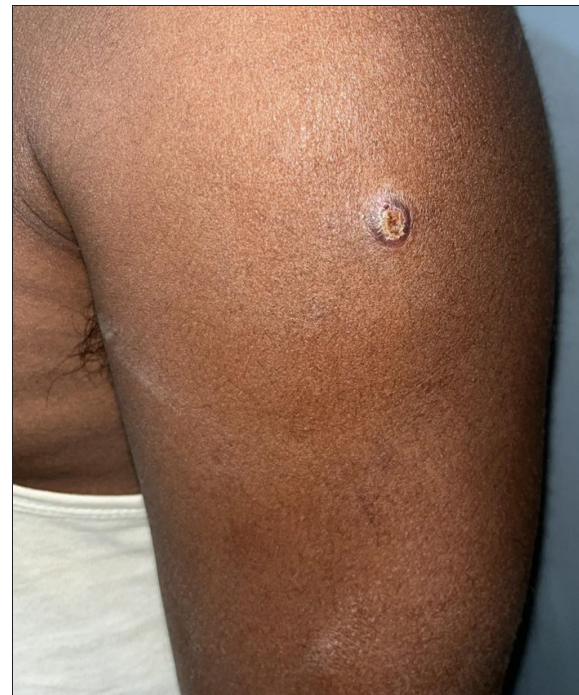
Figure 3 : Nodulo-ulcerative lesion on the left arm – 2 weeks after administration of MIP vaccine.

While MIP is a fairly safe vaccine, local injection site reactions are the most common side effects including papule, nodule or plaque formation with or without erythema and/or tenderness 16,12,19 [Figure 3]. These lesions may ulcerate and heal with scarring [Figure 4]. Regional lymphadenopathy can also occur. 11 Hypertrophic scarring and keloid formation can occur in predisposed patients. 18 Very rarely, generalised granulomatous dermatitis has been reported 31,32 [Figures 5a and 5b]. Two patients presented with multiple erythematous papules and plaques along with persistent ulceration at the vaccination site. They responded favourably to minocycline with a resolution of lesions within 3 months. 31 In another study, a HHC developed an exanthematous rash on the day after vaccination which improved with antihistamines and oral steroids. 18 A recent case series reported multiple injection