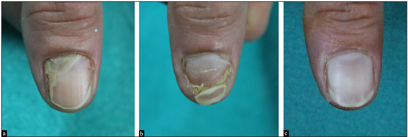
Figure 5: Right thumbnail with onychomycosis treated with capsule itraconazole (a) before treatment (b) after 4 months (c) at 6 months

of the nails involved in both groups were toenails [Table 2]. This was found to be similar to studies by Bhatta et al. 11 and Zhou et al. 10