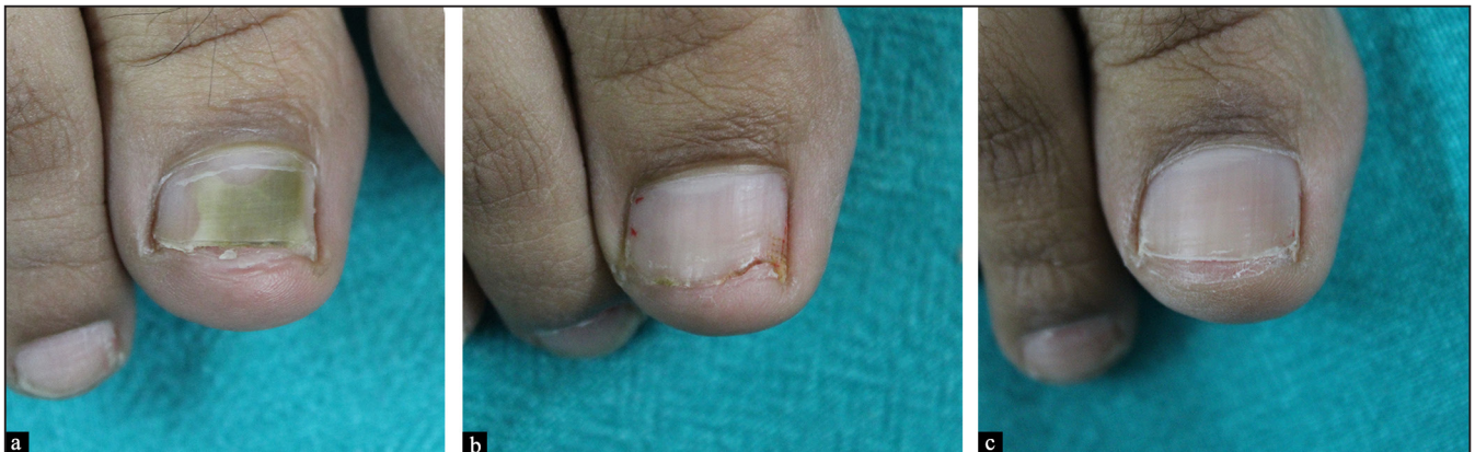
Figure 2: Right great toenail with onychomycosis treated with fractional CO 2 laser combined with 1% terbinafine cream (a) before treatment (b) after 4 months (c) at 6 months