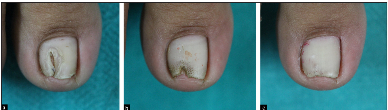
Figure 3: Right great toenail with onychomycosis treated with fractional CO 2 laser combined with 1% terbinafine cream (a) before treatment (b) after 4 months (c) at 6 months