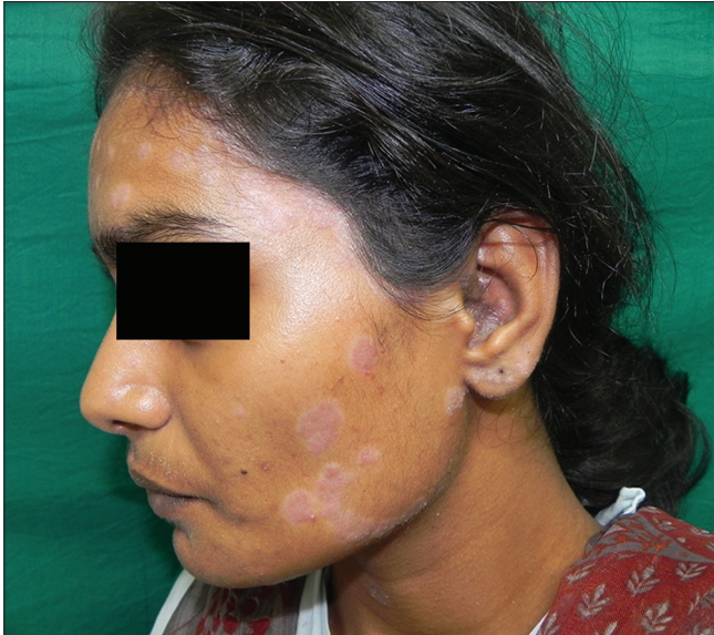
Figure 1: Mixed facial involvement in a woman with psoriatic lesions in the ears, hairline and discrete plaques on the cheeks and forehead

Although psoriasis usually has a bimodal age distribution with equal sex incidence, we found a female preponderance (2.73:1) with two-thirds of the cases between 30 and 60 years of age.