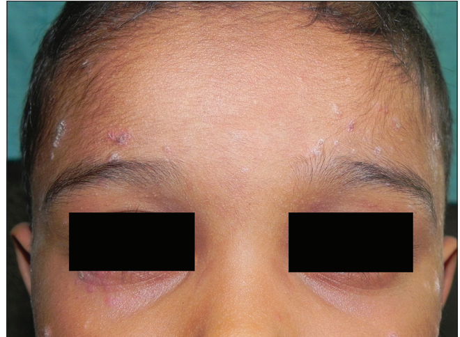
Figure 2: Centروفacial involvement in a child with guttate lesions on the forehead and cheeks