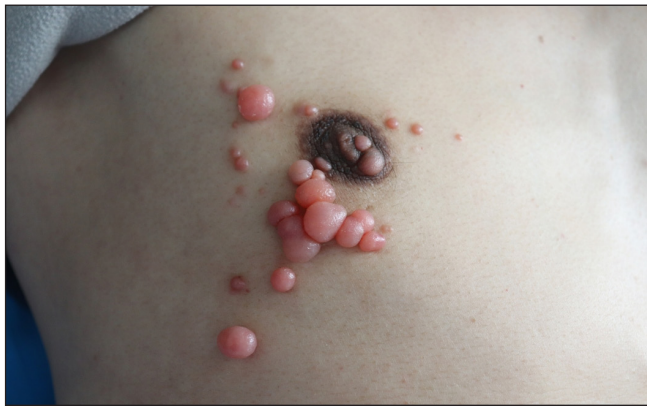
Figure 1: Multiple red nodules on the right chest wall.

the eosinophilic cytoplasmic tumour cell clusters in the dermis, with mitosis and glandular differentiation, similar to the primary lung tumour [Figure 2a]. Immunohistochemical staining showed that the tumour cells were positive for CK7, P63 while negative for CK20 [Figure 2b–2d]. Finally, the diagnosis of lung cancer skin metastasis was made.