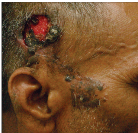
Figure 1: Noduloulcerative basal cell carcinoma in verrucous epidermal nevus