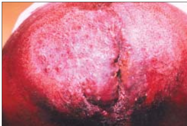
Figure 1: Multiple ulcers and sinuses in perianal and gluteal regions

Cutaneous amoebiasis develops when amoebae escape to the contiguous skin from bowel. It presents