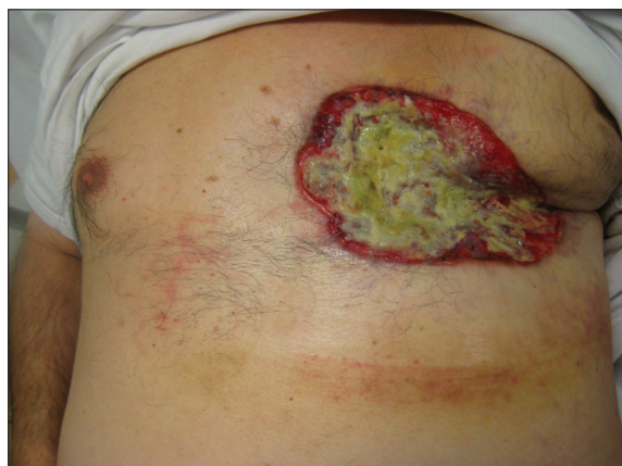
Figure 1: Ulcerated lesion with bright red edges localized in the area of the left breast (12 x 9 cm)

The patient reported intense pain in the spinal area, urination and defecation discomfort and modest spastic paraparesis. Contrast-enhanced computed tomography (CT) of the brain, chest and abdomen and magnetic resonance imaging (MRI) of the spine were carried out, highlighting secondary osteolytic