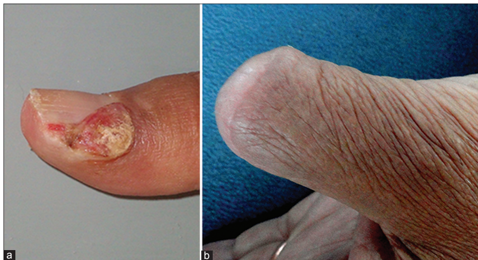
Figure 1: (a) Erythematous moist plaque arising from the lateral nail fold of the left thumb and covering the adjoining lateral one-third of the nail plate with crusting at multiple sites, (b) disarticulated thumb at interphalangeal joint after excision of carcinoma

Bone invasion has been reported in 18–60% of cases of squamous cell carcinoma of the nail apparatus. [3] Although traditionally, distal amputation has been performed for all squamous cell carcinomas of the nail unit, of late, tissue-conserving Moh's micrographic