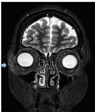
Figure 3: T2-weighted coronal magnetic resonance image showing a poorly delineated hyperintense mass in the right lower eyelid (indicated by the blue arrow)

with ulcerated nodules which are histopathologically characterized by the presence of necrobiosis surrounded by palisading epithelioid histiocytes, more numerous Touton giant cells and cholesterol clefts. [3] It is commonly associated with paraproteinemia and multiple myeloma. [1,5] Erdheim–Chester disease is notable for the progressive fibrosclerosis of the orbit and carries the worst prognosis within this spectrum due to the frequent impairment of visual acuity and fibrotic involvement of internal organs. [1,2] Adult-onset asthma with periocular xanthogranuloma, on the other hand, is frequently associated with lymphadenopathy and elevated levels of polyclonal IgG in addition to its hallmark feature of adult-onset asthma. [1] The distinctive histopathological finding in this disorder is the presence of large lymphoid aggregates with reactive germinal centers. [1,2] Adult-onset orbital xanthogranuloma presents with isolated orbital involvement without accompanying immune dysfunction, asthma or paraproteinemia; however,