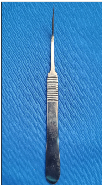
Figure 1a: The stainless-steel instrument

We customised a stainless-steel instrument that can address all the issues as a one for all tool [Figures 1a and 1b]