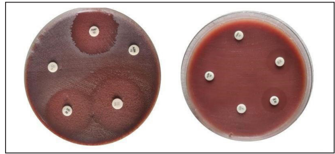
Figure 1: Antibiotics (minocycline, doxycycline, ampicillin, azithromycin and clindamycin) placed on Brucella Blood Agar showing different zones of inhibition (disc diffusion technique).

The skin surface was cleaned with ethanol. The sample was collected according to the type of lesion. Comedones/pustules were extracted/expressed from the lesion using a sterile needle and placed in a thioglycolate transport medium. The sample was mixed for 30 seconds in a vortex mixer to disperse the bacteria. The vortex sample was inoculated on Propionibacterium selective agar, placed in a Becton and Dickinson (BD) GasPak EZ Sachet (Germany) (anaerobic gas generating pouch system with indicator) and incubated at 37°C for 48 hours to isolate Cutibacterium . After incubation, the characteristic large white to yellow dry colonies were identified as Cutibacterium species based on Gram's staining,