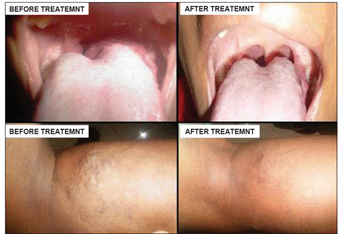
Figure 2: Before and after treatment photographs – lymphangioma posterior one-third of the tongue and varicose vein-leg