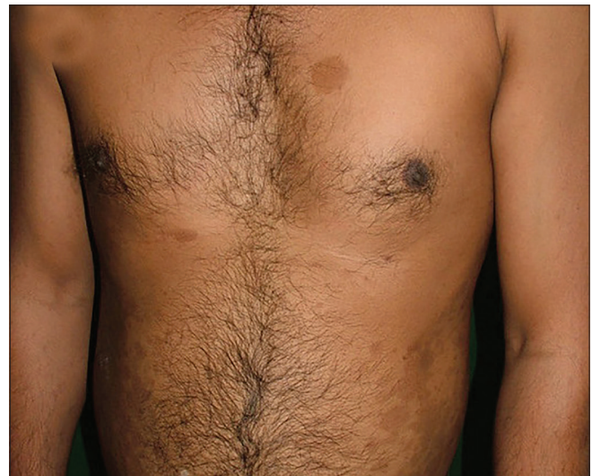
Figure 3b: Same patient showing reduction in psoriasis area severity index to 0 at 3 rd follow-up visit