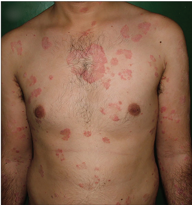
Figure 2a: Patient receiving azathioprine 300 mg weekly pulses with psoriasis area severity index 16.4 at baseline