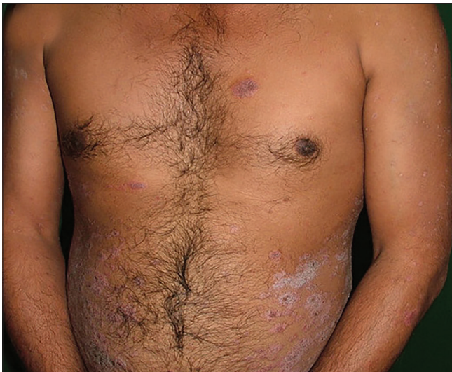
Figure 3a: Patient receiving weekly 15 mg methotrexate with psoriasis area severity index 17.4 at baseline