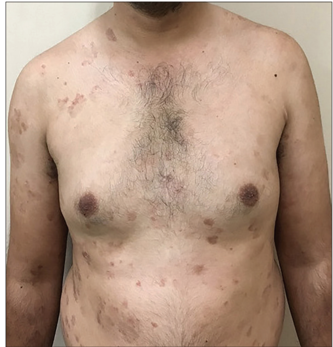
Figure 2b: Same patient showing reduction in psoriasis area severity index to 4.8 at 3 rd follow-up visit

in 48 (60%) patients {17 (35.4%) patients in group 1 and 31 (64.9%) in group 2} and good (PASI 50) in 59 (73.8%) patients {22 (37.3%) patients in group 1 and 37 (62.7%) in group 2} [Table 2 and Figures 2, 3]. Mean PASI at 20 weeks was 1.9 (0-9.9) in group 1 while it was 0.89 (0-5.8) in group 2.