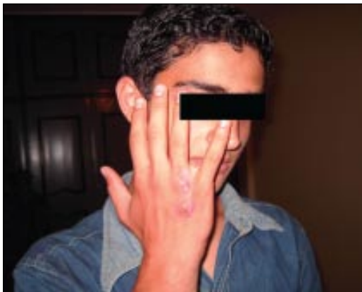
Figure 1: Inflammatory nodular lesions in back of patient's right hand