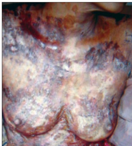
Figure 1: Erythematous scaly annular and serpiginous plaques with areas of erosions and pigmentation on the trunk

A 52 year-old woman presented with a two-year history of pruritic, burning and expanding red rings involving the entire body. She had marked fatigue, anorexia and weight loss. Examination revealed a cachectic woman with symmetrical erythematous annular and scaly patches involving the trunk [Figure 1], lower limbs and back. A few pustules and vesicles were present on the trunk. Intertriginous areas showed erosions. Glossitis and stomatitis were also present.