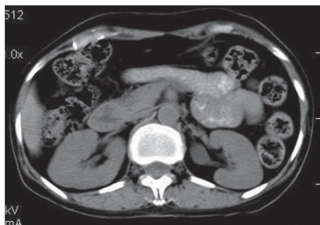
Figure 3: CT scan of the abdomen showing a well-enhanced, soft tissue lesion 56 x 40 x 30 mm in size with a speck of calcification in the tail of the pancreas

Necrolytic migratory erythema (NME) is a rare skin condition characteristically present as irregular annular eruptions with serpiginous advancing borders. Vesicles, pustules or bullae