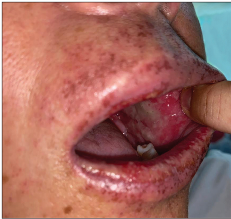
Figure 3: Erosions on the oral mucosa covered with exudation