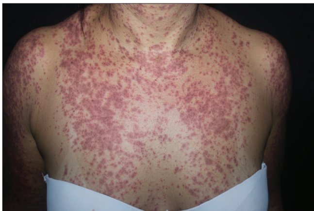
Figure 1: Vesicles over confluent erythematous macules on the upper trunk

Differentiating erythema multiforme with mucous membrane involvement from Stevens-Johnson syndrome is a challenge. The SCAR group study differentiates these two entities