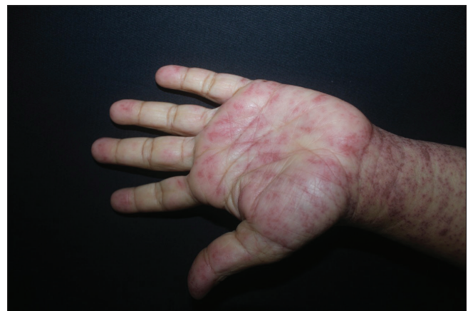
Figure 2: Atypical target lesions on the palm of the hand