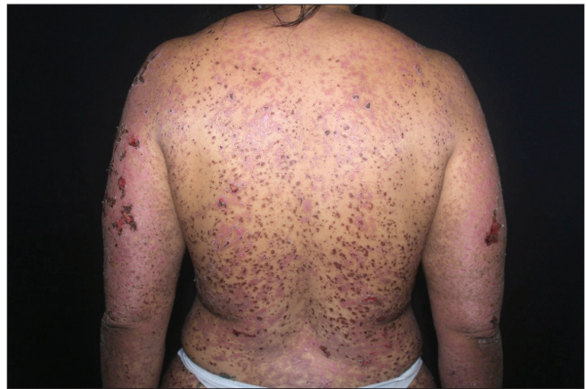
Figure 4: Epidermal detachment on the back and arms after one week