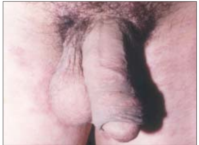
Figure 3: Erythematous plaques on penile shaft with scattered lesions on the thighs