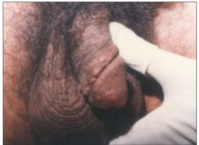
Figure 4: Nodules on glans and inner surface of prepuce