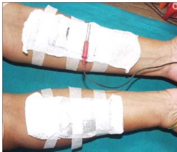
Figure 1: Iontophoretic delivery of dexamethasone

After one minute, the test site was wiped with filter paper to remove the excess histamine solution. The size of wheal was recorded in millimeters after 15 minutes. The mean size of wheal was calculated by