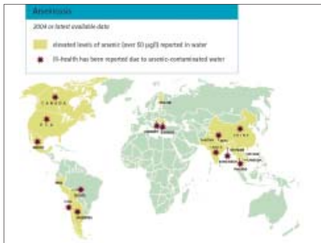
Figure 1A: Global situation of arsenicosis 2004 ( www.who.int/entity/ceh/publications/en/08fluor.pdf )

It is a disease of multifactorial causation, with arsenic-contaminated ground water as the prime culprit. The triad of epidemiological factors playing a role in the development of arsenicosis is detailed below: