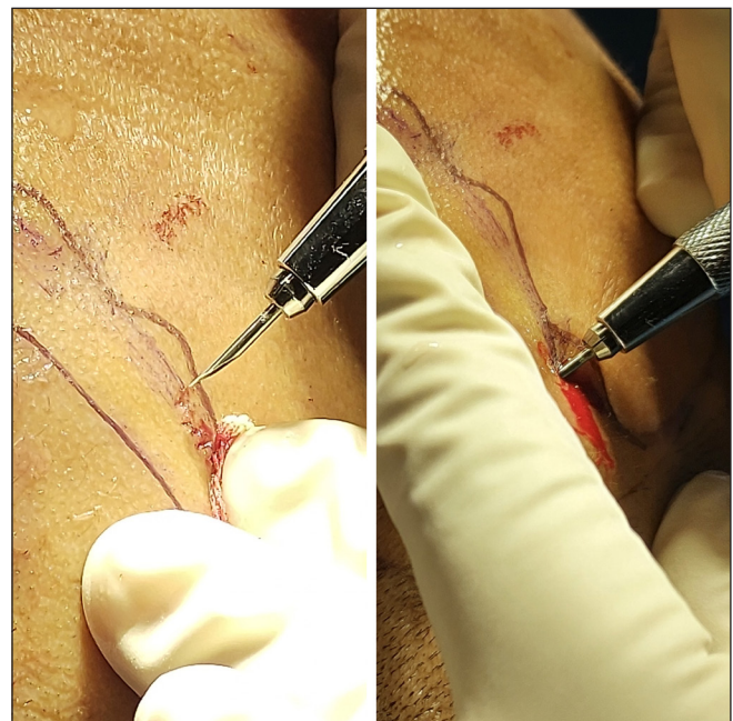
Figure 2: Slit making in hair restoration surgery using mechanical lead pencil with 19G needle.

How to cite this article: Vendhan S, Neema S, Vasudevan B, Bala N. Use of mechanical pencil with needle for slit making in hair restoration surgery. Indian J Dermatol Venereol Leprol. 2024;90:260–1. doi: 10.25259/IJDVL_806_2023