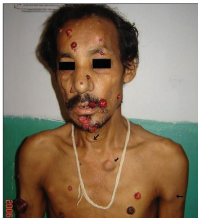
Figure 1: Cutaneous and subcutaneous (arrows) lesions