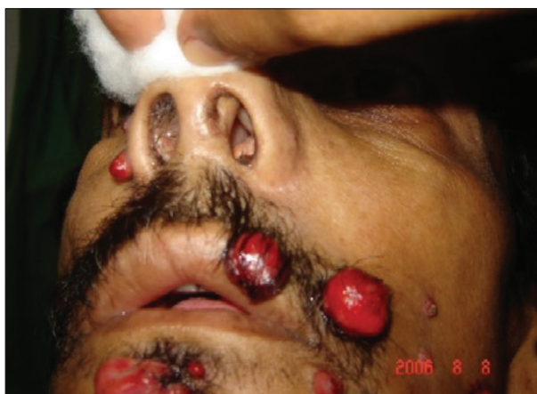
Figure 2: Polypoidal lesion seen through left nose and satellite lesions on face

Other systemic examinations revealed no abnormality. Hematological examination showed moderate anemia (8.8 gm%) and all biochemical parameters were within normal range. Chest X-ray and ultrasonography of abdomen and pelvis showed no abnormality. Serological tests for HIV and syphilis were negative.