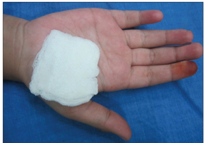
Figure 1b: The presence of wheals on the palms after 5 min, on provocation with tap water, thereby showing positive provocation test for aquagenic urticaria