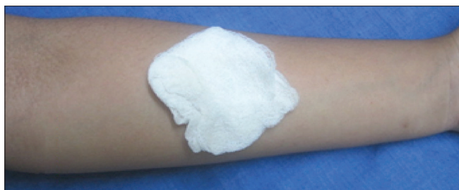
Figure 2a: Normal forearms before provocation

urticaria in which contact with water, irrespective of its temperature evokes wheals. 4,5 Since its first description by Shelley and Rawnsley in 1964, <50 cases have been described. 6,7 Aquagenic urticaria is more common in females than males and appears during puberty or several years later. 4