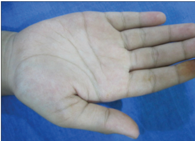
Figure 1a: Normal palms before provocation

Physical urticarias are a unique subgroup of chronic urticarias, in which wheals can be repeatedly induced by the corresponding physical stimuli. 3 Aquagenic urticaria is a rare form of physical