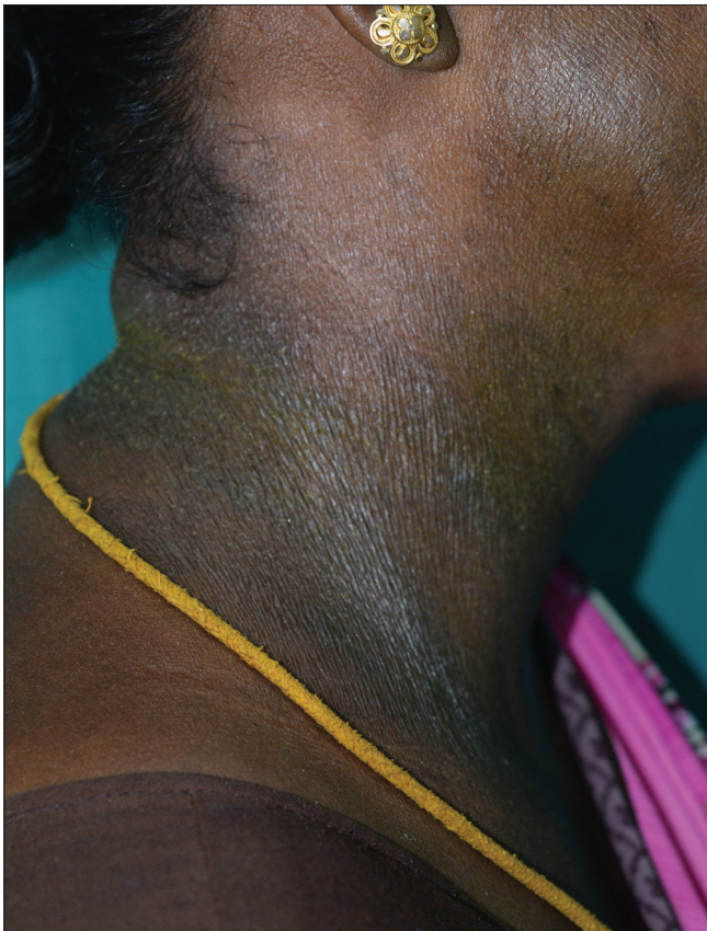
Figure 5: Pigmented contact dermatitis over face and neck after traditional application of turmeric on face, neck and thali.