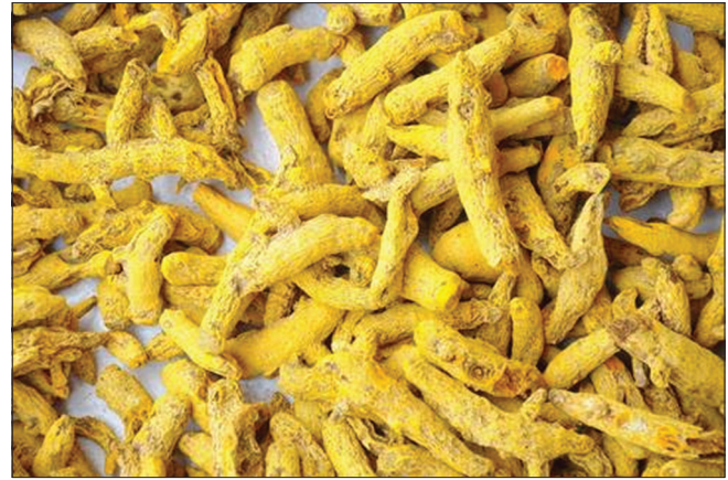
Figure 2: Rhizomes of Curcuma longa .L