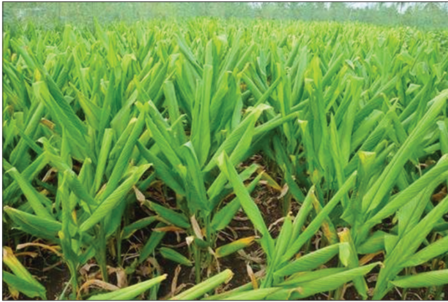
Figure 1: Curcuma longa .L - a perennial medicinal herb