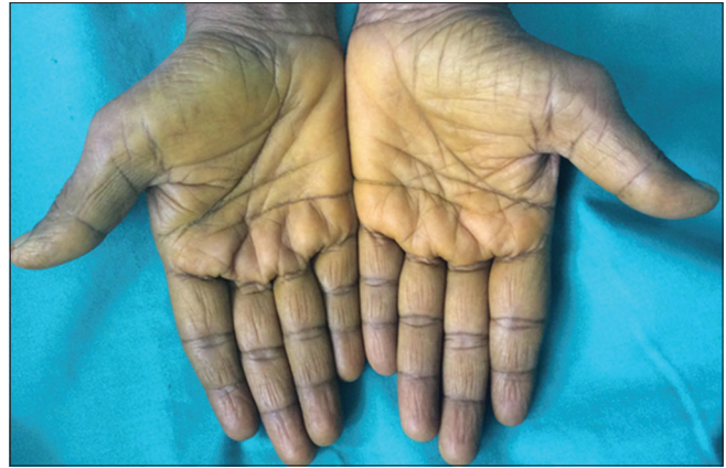
Figure 4b: Yellowish discoloration of hands after application of turmeric

Curcumin accelerated wound healing in rats is attributed to its antioxidant properties. It inhibits cyclo-oxygenase 2, lipo-oxygenase