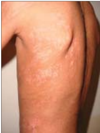
Figure 1: Multiple atrophic patches distributed along Blaschko's lines