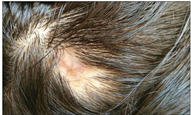
Figure 1c: At 14 months follow-up after intralesional radiofrequency and superficial shave radiofrequency