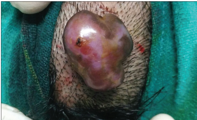
Figure 1a: Pyogenic granuloma on scalp