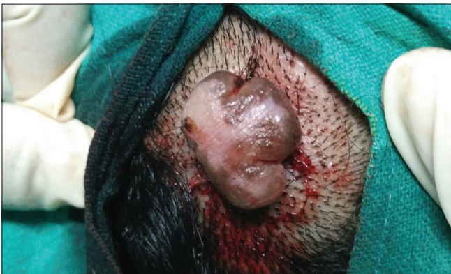
Figure 1b: After being subjected to intralesional radiofrequency, appearing shrunken and blanched