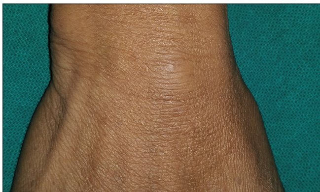
Figure 2b: At 6 months follow-up after a single sitting of intralesional radiofrequency, lesion subsided by >90%

simultaneously occupies both hands to hold the intravenous cannula and radiofrequency probe, it is mastered easily with practice. A small number of cases was another limitation of our study. Radiological guidance like pre-operative or intra-operative ultrasound may enhance the results with this technique.