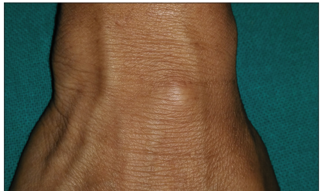
Figure 2a: Ganglion on right wrist

Intralesional radiofrequency is still evolving and various studies have used different methods ranging from a surface application for venous malformations, inserting insulated probes in keloids to inserting uninsulated hypodermic needles in angiolympoid hyperplasia. 4-6 This particular technique is inexpensive and minimizes operative scars in the management of innocuous swellings of aesthetic concern and previous reports highlight the same. 1-3