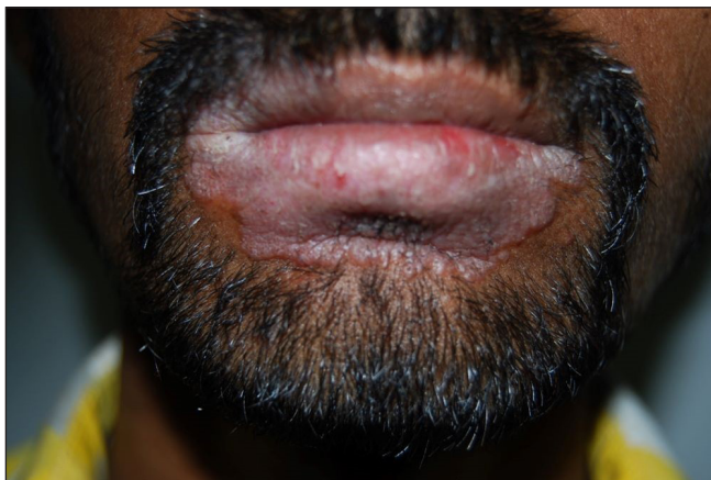
Figure 1: Macerated and crusted plaque with erosions over the lower lip, angles of the mouth, and chin.

showed granulomatous inflammation with lymphocytes, few aggregates of neutrophils, and giant cells exhibiting brownish-pigmented sclerotic bodies which confirmed the diagnosis of chromoblastomycosis. A touch preparation of the skin biopsy specimen in KOH showed sclerotic bodies. The patient had already received itraconazole 200 mg/d for 2 years with no response. Hence, he was shifted to a combination of voriconazole 200 mg/d and terbinafine 500 mg/d for a period of 6 months. Despite the second-line treatment, skin lesions progressed to involve both lips and the right nasolabial area with the development of indurated, hyperpigmented, and mamillated plaques on the nose and haemorrhagic, necrotic, and crusted plaque over the right angle of the mouth with intractable itching [Figure 2]. A second biopsy done also showed a granulomatous reaction with giant cells containing thick-walled golden-brown sclerotic bodies consistent with chromoblastomycosis [Figure 3]. Fungal culture of the biopsy specimen, on Sabouraud's dextrose agar grew moist, yeast-like mucoid colonies with black reverse [Figure 4].