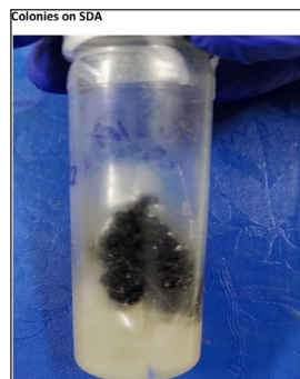
Figure 4: Sabouraud's dextrose agar, showing yeast-like mucoid colonies with black reverse.