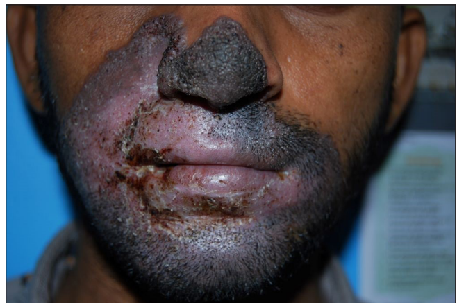
Figure 2: Hyperpigmented, indurated plaque over the lips, right nasolabial area. Hyperpigmented mamillated plaque over the nose and necrotic ulcer involving the right angle of the mouth.