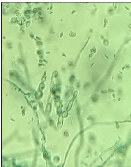
Figure 5: Lactophenol cotton blue mount showing erect, multiseptate, cylindrical, spine-like conidiophores (1000x).