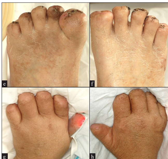
Figure 2e-h: Photographs of the extremities following amputation, seven weeks after the amputation surgery.

amputations of the limbs. 2,3 In the present case, fortunately, the necrotic area was localised and amputation at the level of interphalangeal joints was adequate.