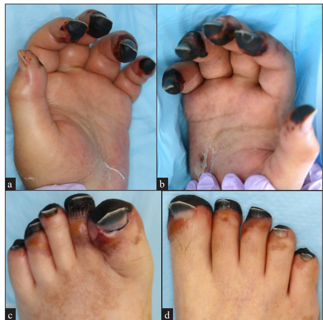
Figure 1a–d: Seventy two-year-old man presenting with peripheral symmetrical gangrene involving all fingers and toes.

SPG is a life-threatening condition characterised by a triad of shock, disseminated intravascular coagulation (DIC) and anticoagulant depletion. 1 It has been speculated that a reduction in protein C is involved in the aetiopathogenesis. 1 SPG is associated with a high mortality and it has been reported that more than half of the surviving patients required